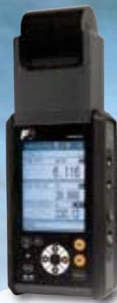
Provided with printer for screen hard copy