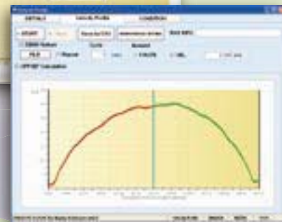
Inner pipe of flow rate distribution screen