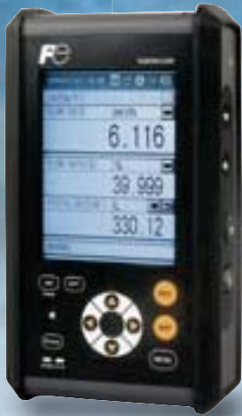
Flow transmitter type (FSC)