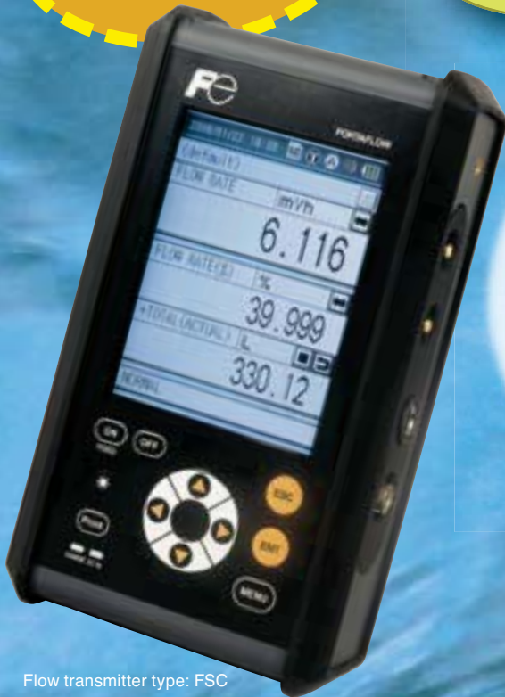
Flow transmitter type: FSC

The measurement data can be stored in a SD memory card for a long time