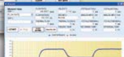
Flow rate measurement of trend screen

Various parameter setting is also available on a PC.